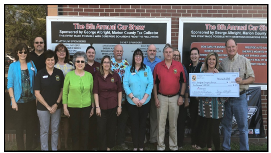
We look forward to seeing you again next year!

Our office donated $5000 to Interfaith Emergency Services, as well as donations to the Semesco Foundation, Stop Children's Cancer, and The Centers.